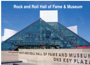
Rock and Roll Hall of Fame & Museum