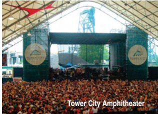
Tower City Amphitheater