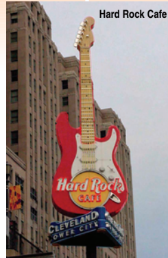
Hard Rock Cafe