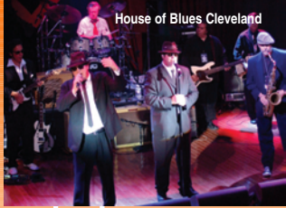
House of Blues Cleveland